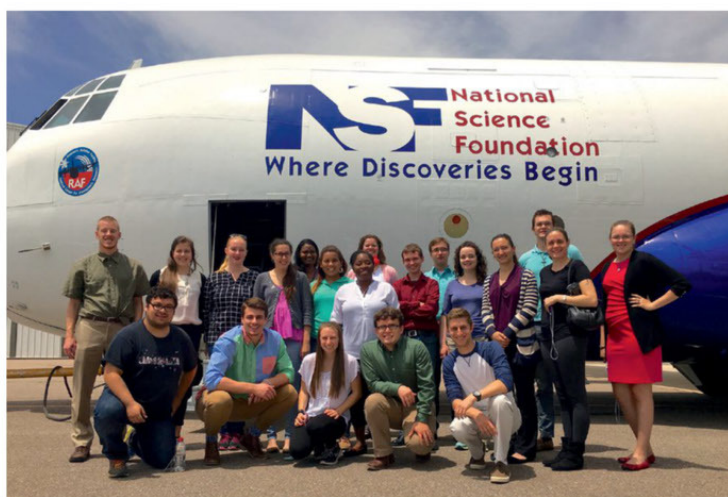
FIG. 1. Students in the 2016 ULW visiting the NCAR Research Aviation Facility.

Built into the three themes are team-building and peer-networking activities so that participants who