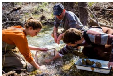
Students perform a benthic macroinvertebrate survey to assess stream health in Bull Creek.