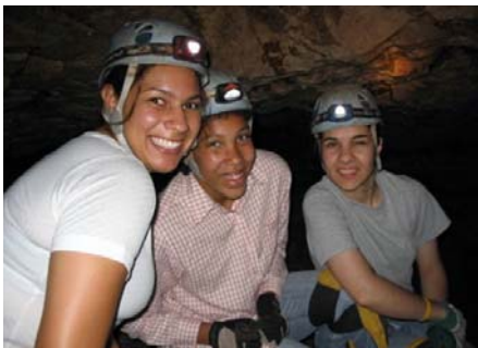
REU students studying speleothem formation in Inner Space Cavern.

Applications are due February 1, 2018. Application and more details available on the website!